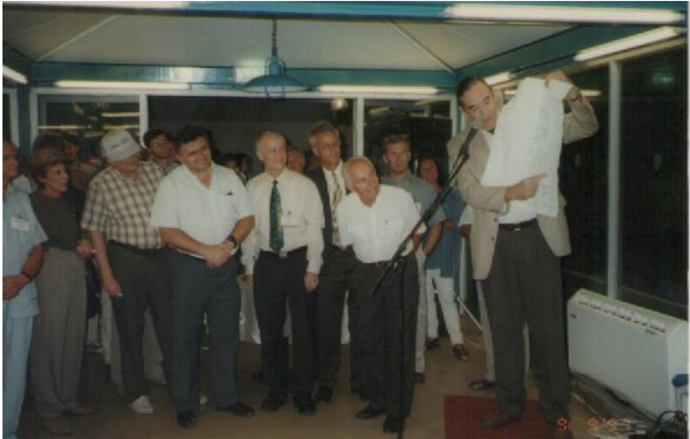
Visit to the museum of Israel